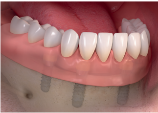
Removable denture supported by 4 implants