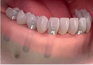
Non-removable bridge supported by 4 to 6 implants (6 shown)