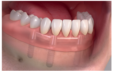
Removable implant-retained denture