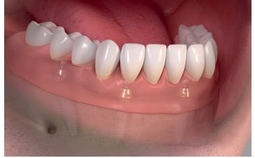
Non-removable denture supported by 4 implants